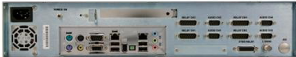
MAX / International Datacasting (IDC) / Westwood One