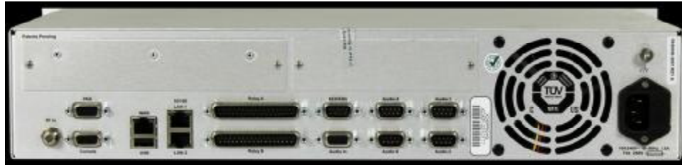
XDS PRO-1 / PRO-1Q / PRO-4 / PRO4P / PRO-4Q

Partial users list - Clear Channel / Cumulus / Moody / Westwood One / Radio America / Skyview